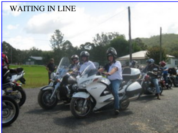
WAITING IN LINE