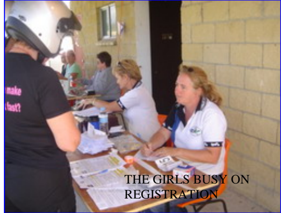
THE GIRLS BUSY ON REGISTRATION