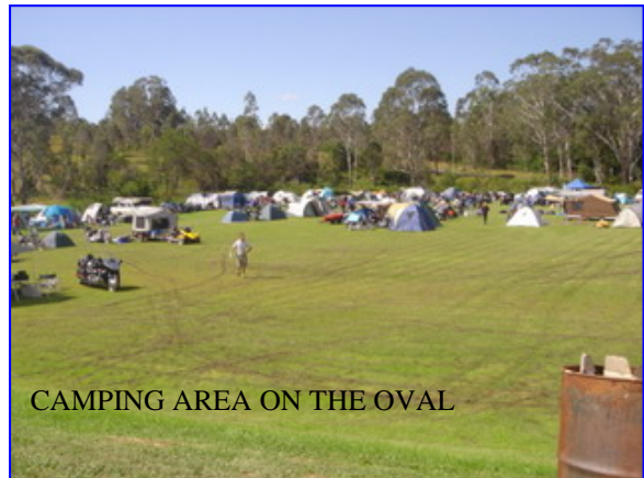
CAMPING AREA ON THE OVAL