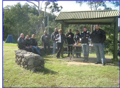
NIMBIN RIDE MORNING TEA