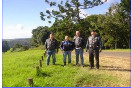
RIDE TO O' REILLY'S