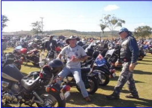
HONDA FOUR RIDE