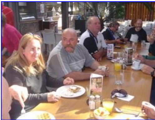
BREAKFAST MORNING RIDE