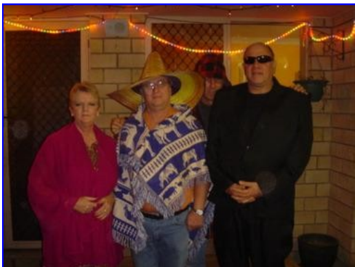
ROUND THE WORLD DINNER PARTY