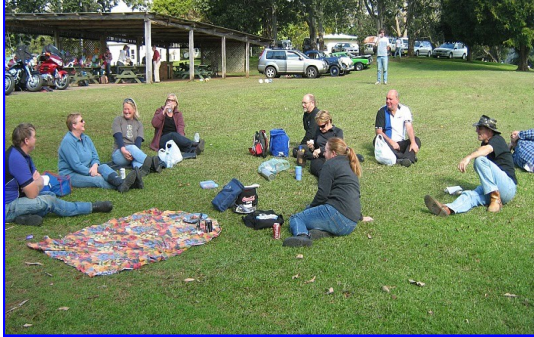
CLARRIE HALL DAM