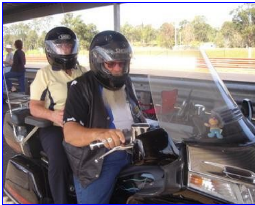
BLIND SOCIETY SUPPORT RIDE