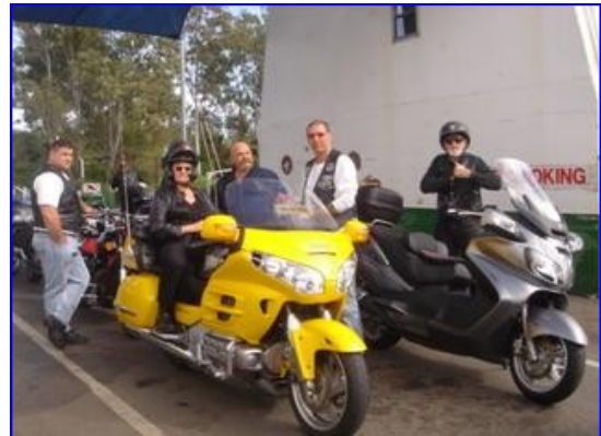
RIDE TO MT COOTHA