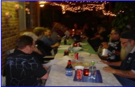
GRINGO, VIBES AND BOB'S BIRTHDAY