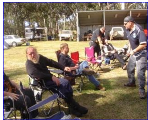
CHRISTMAS IN JULY