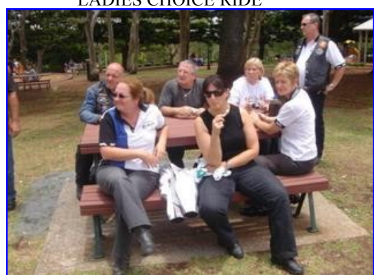
TOOWOOMBA TOY RUN