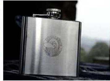
Stainless steel hip flask $25.50